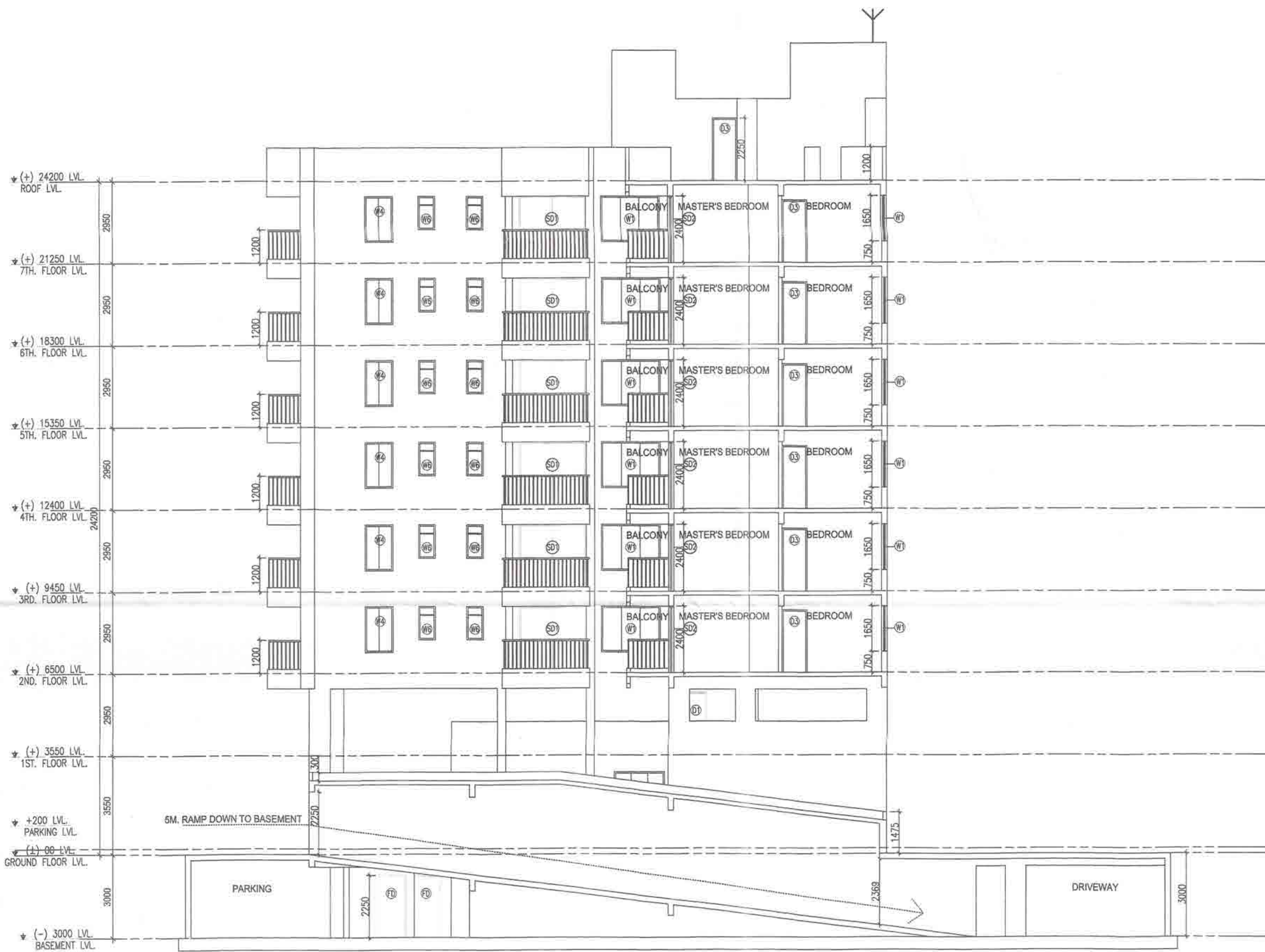
SECTION 06B-06B SCALE : 1:100